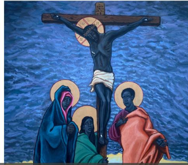
GOOD FRIDAY MARCH 29, 7:00