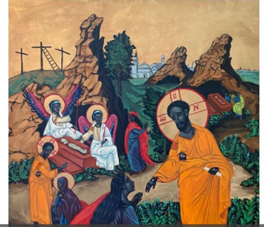
EASTER SUNDAY MARCH 31, 10:30