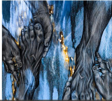
MAUNDY THURSDAY MARCH 28, 7:00