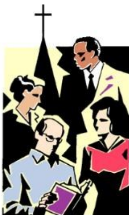
Church Leadership Council