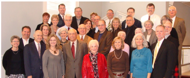
Capital Campaign Leadership Team